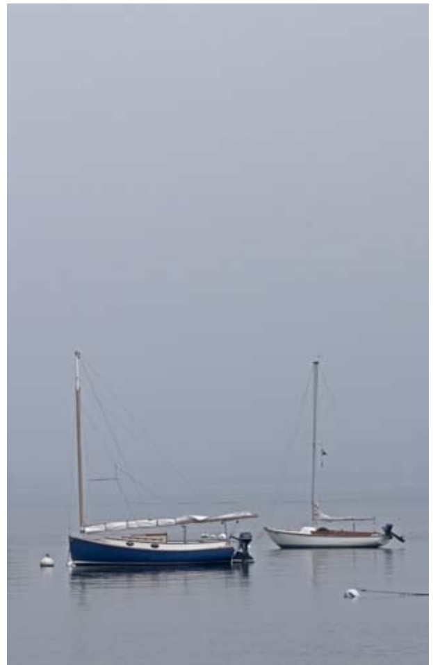
"Catboat and Sloop," an image from Krauzyk's Coastal New England Series, shows another side of the tiny islands many moods.

I think the subject matter and esthetic decides that for me. The Nantucket photos thus far scream for color. While the Little Compton-Sakonnet Light photos could be in nothing but black and white to me.